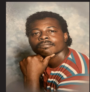
Name that deacon, usher, and worship singer?