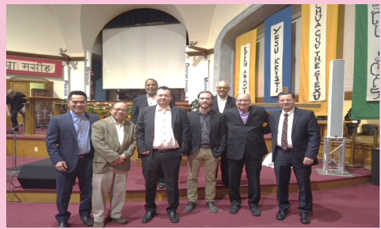
8 UBC Preachers preached during Holy Week